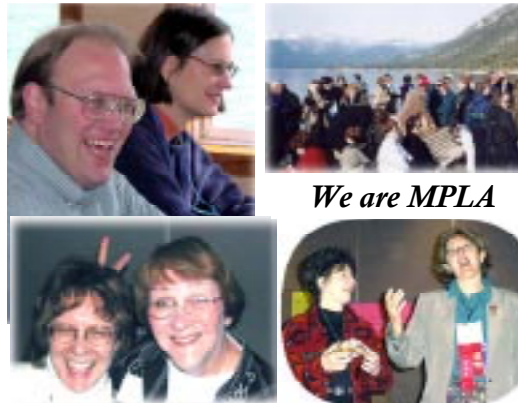
We are MPLA