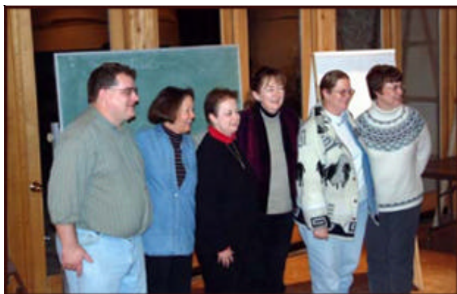
The 2004 Ghost Ranch Leadership Institute Mentors.