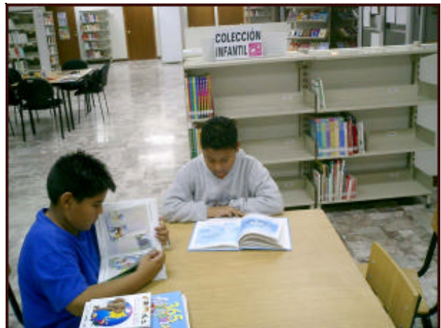
Two boys reading in the children’s area of the Biblioteca Hermanos Escobar, the newest branch in the public library system of Ciudad Juárez, Mexico.