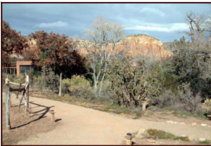
Beautiful Ghost Ranch in Abiquiu, NM serves as the setting for the MPLA Leadership Institute.

Leadership and management skills can be taught. Even better than this, is knowing that we are all "born leaders," and with a little soul searching and facilitation, we can realize the potential within ourselves.