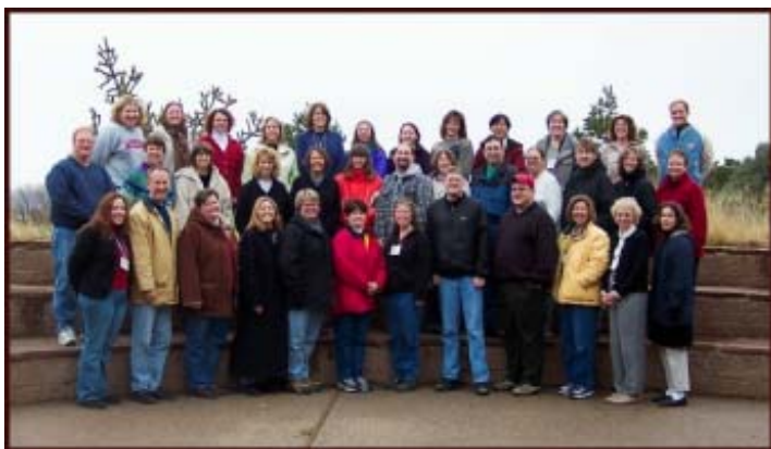
2003 MPLA Leadership Institute attendees.

Participants selected for attendance at this year's institute are listed on page 7 of this newsletter. After the institute this year's attendees will leave New Mexico with a new appreciation and understanding of their own strengths and weaknesses and their potential as leaders in MPLA and other professional milieus, including their own library organizations. This quality professional development opportunity is sure to change lives and libraries. Please be sure to encourage this year's participants to continue to development the leadership potential already recognized by the state committees who evaluated the many excellent applicants. Give these individuals and others opportunities to grow and to learn so that this next generation of library leaders will be even more dynamic and wonderful than the previous one has been!